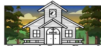
Heaven's Door Chapel